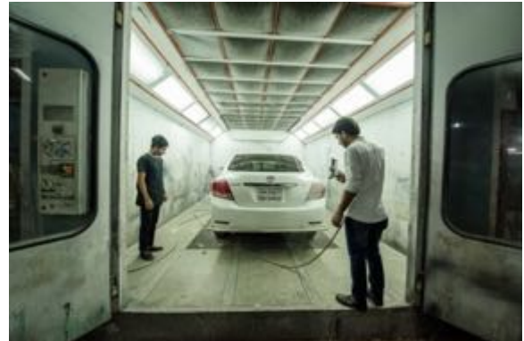
Paint work ongoing in fully equipped paint booth

No single automotive trader in Bangladesh has such comprehensive workshop and support engineering facilities at one place, which will cater all the technical needs of the customers. This facility is now being considered to be expanded and optimally used for other commercial/Industrial operations, like reconditioning of automotive vehicles, using the bonded house concept. Haq's Bay is also