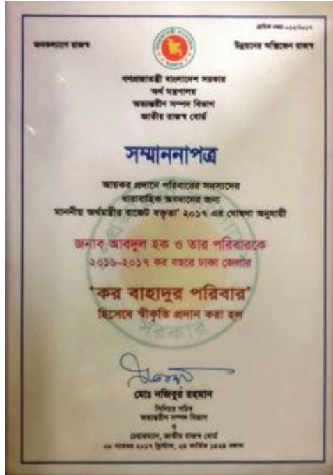
Pic: “কর বাহাদুর পরিবার” recognition from the Govt. of Bangladesh